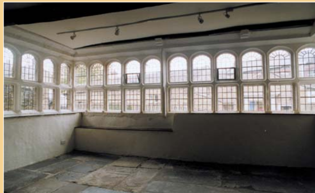
The distinctive mullion windows stretching the whole length of the ground floor

Following Richard Preston’s death in 1695, the house passed to his daughter. She sold it in 1703 to another local family, the Dawsons. Since that time the building has rarely been used as a family home, which possibly led to it becoming known as The Folly