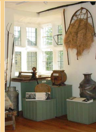
Part of ‘The Story of North Craven’ exhibition