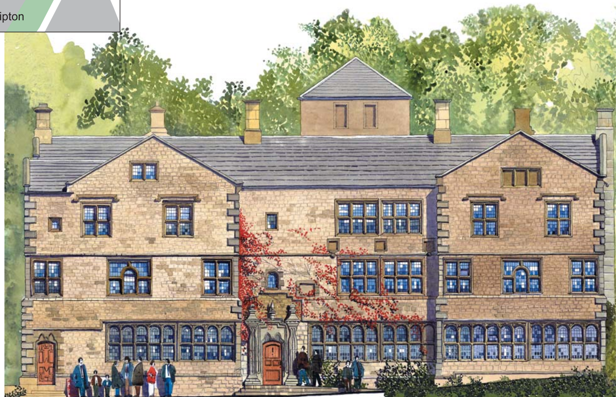
Illustration of the Folly by Richard Carmen. © Niall Phillips Architects

NORTH CRAVEN BUILDING PRESERVATION TRUST