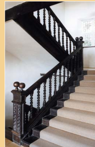
The fine oak staircase with ‘barley-sugar’ twisted balusters