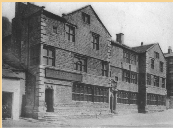
The Folly c.1900

‘First class display of exhibits – very professionally done’