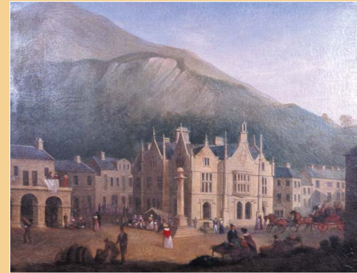
Oil painting of Settle Market Place from the west c.1838