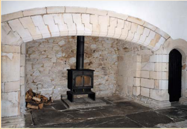
Inglenook fireplace in the Main Hall