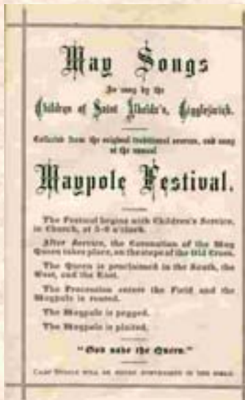
Cover of a programme detailing May celebrations c. 1895

The 'Archive Alive!' project has been running since June 2008 at the Museum of North Craven Life in Settle and culminates in an exhibition which runs from 7 April to 23 June this year. The exhibition celebrates the wealth of fascinating material contained in a collection of local archives and the innovative projects which they have inspired.