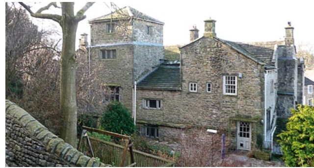
View of the North Range and rear garden

Reuniting The Folly In February 2010 an opportunity arose for the Trust to purchase the North Range, supported by a loan from the Architectural Heritage Fund. The Trust was then able to reunite the two halves of The Folly and will open it in its entirety for all to enjoy, following restoration and refurbishment.