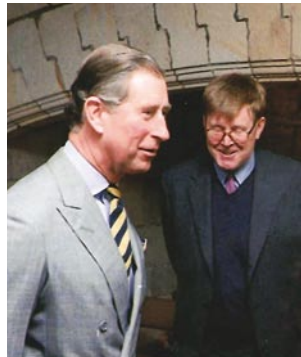
HRH The Prince of Wales with Alan Bennett, Trust President, at the opening of The Folly

The building stands on the original main road into the town and undoubtedly was built to make an impact. It had extensive gardens across the street with a garden tower, now demolished. In the 18th century the new Toll road became the main highway into Settle, leaving The Folly in a quiet corner of the town.